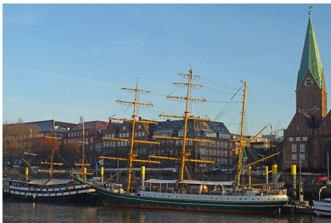
Alexander von Humboldt @ Schlachte

Workshops and presentations: HSB, Neustadtswall 30 Simulators: HSB and DGzRS, Werderstrasse 73 Ships: Schlachte (along the Weser River)