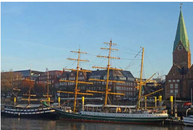
Alexander von Humboldt @ Schlachte

Workshops and presentations: HSB, Neustadtswall 30 Simulators: HSB and DGzRS, Werderstrasse 73 Ships: Schlachte (along the Weser River)